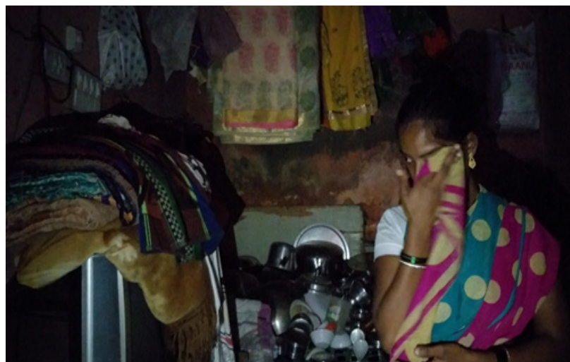
Wiping her tears while the flood wiped her life