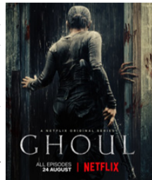
Review: MRUNAL JAGTAP

The actors chosen embody their characters very well. I liked the way the whole story has been plotted. I usually feel horror series in Bollywood looks more of comedy show than horror trip, but this series is something that is truly horrifying. I will give it a 4/5. Its a must watch.