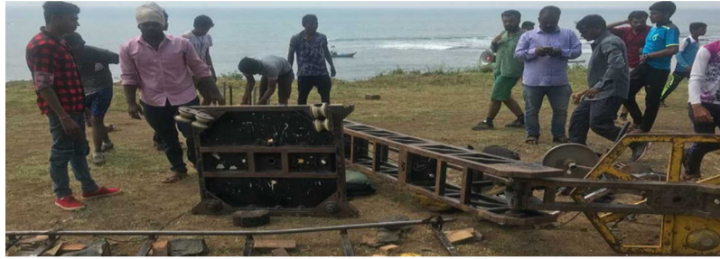
Actual site of accident.

The student had alleged that they raised a complaint about the faulty equip-